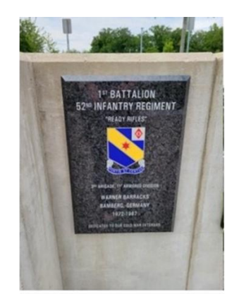
Unit Tribute Plaque at the National Museum of the United States Army

• During the coming year, we will look for additional places where we can place memorial plaques highlighting the history of our battalion.