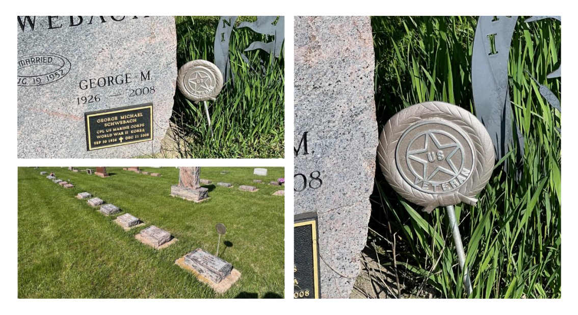
Examples from Commercial Vendors