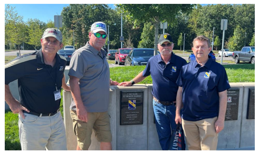
1<sup>st</sup> Battalion, 52<sup>nd</sup> Infantry Regiment Unit Tribute Plaque at the National Museum of the United States Army

• During the coming year, we will look for additional places where we can place memorial plaques highlighting the history of our battalion.