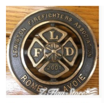
Custom Grave Marker