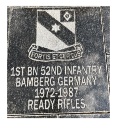
Paver Stone at the National Infantry Museum