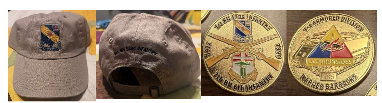
Hats $20 Coins $10 Coasters $12.50

Unit Crest Hats, Coins, and Coasters for Sale